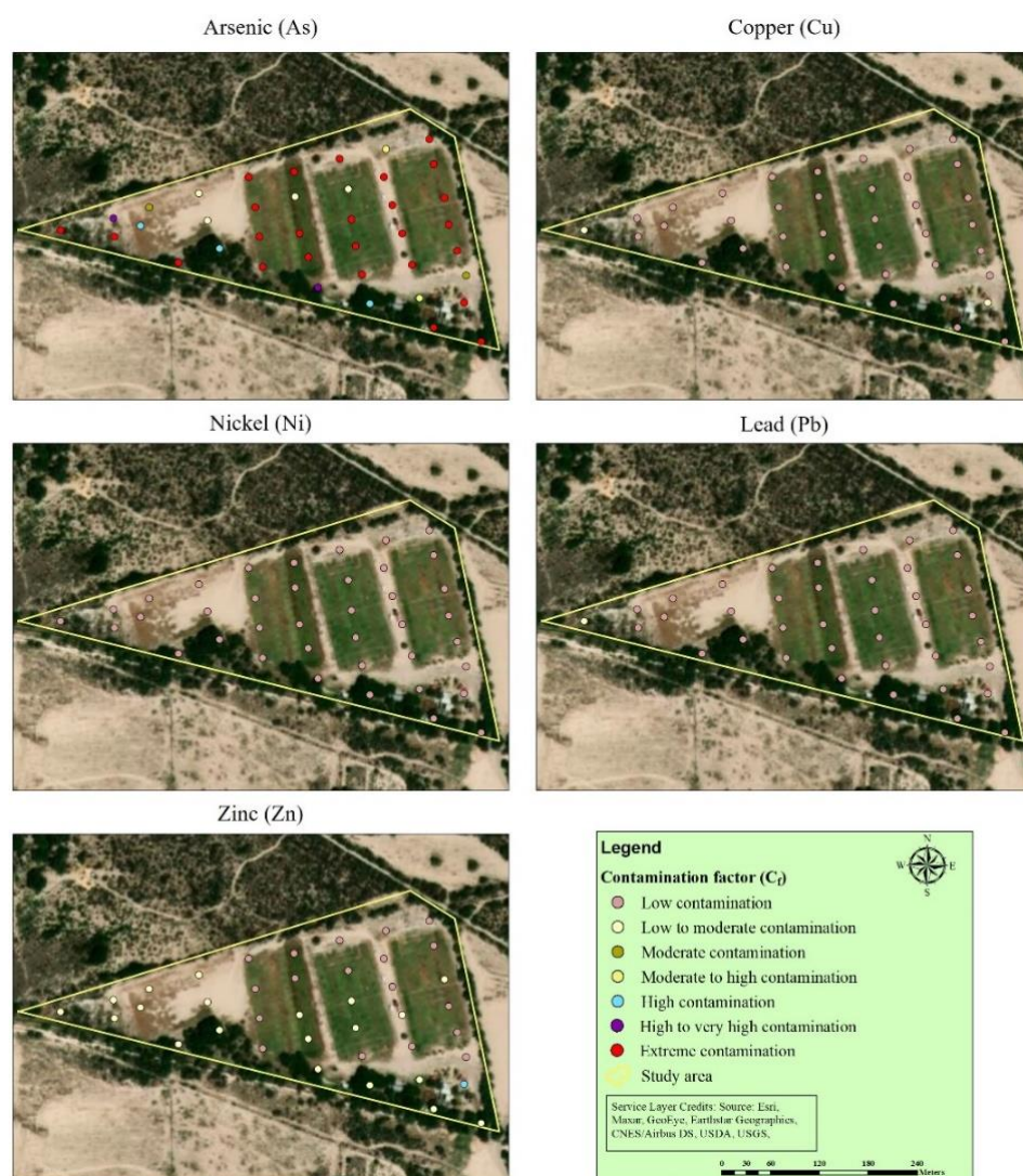
Figure 3. Classifications of contamination factor ( C_f ) for soil sampling locations.

The toxic metal contamination and potential ecological risk of the surface soils were assessed using C_f , E_r , and RI , as shown in Table 6. These three metal evaluation indices based on the soil toxic metal background reference value for the study soil can demonstrate the level of external contamination. The order of mean E_r was As (119.44) > Cu (2.87) > Pb (2.17) > Zn (1.18) > Ni (0.46). The assessment of E_r values also represented that As was the main contaminant in the study soil because the mean concentration level of As was at a considerable risk level ( 80 \leq E_r < 160 ). Except for As, the mean E_r values of the remaining four metals were all less than 40, indicating that these metals presented a relatively low-risk level in the soil.