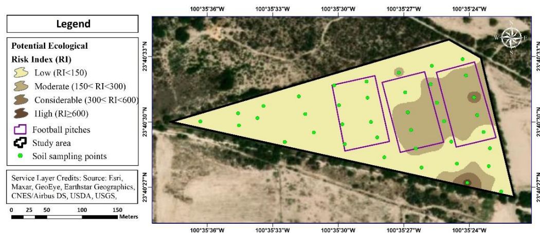
Figure 4. Spatial distribution of potential ecological risk index ( RI ).

The spatial distribution pattern of the potential ecological risk level ( RI ) for five different toxic metals contamination (i.e., As, Cu, Ni, Pb, and Zn) in the soil is shown in Figure 4. For the spatial distribution, the inverse distance weighting (IDW) interpolation technique was applied to evaluate the distribution of potential ecological risk levels for toxic metals in the surface soil, because it is a suitable approach for interpolating regularly spaced specific sampling point data [14]. GIS software was used to map the potential ecological risk level areas and classify them into four categories. According to the results of the potential ecological risk level distribution pattern, 73.52 per cent of the soils were having low ecological risk level, 24.80 per cent was in the moderate ecological risk level, 1.50 per cent of soils had considerable ecological risk level, while 0.19 per cent of soils was in the high ecological risk level. Furthermore, most areas are in the low ecological risk level zone, but specific areas of soccer grounds have moderate ecological risk levels because of the persistent use of As-contaminated irrigated water.