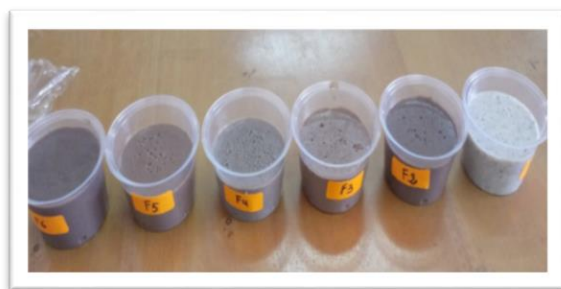
Dairy desserts based flaxseed powder