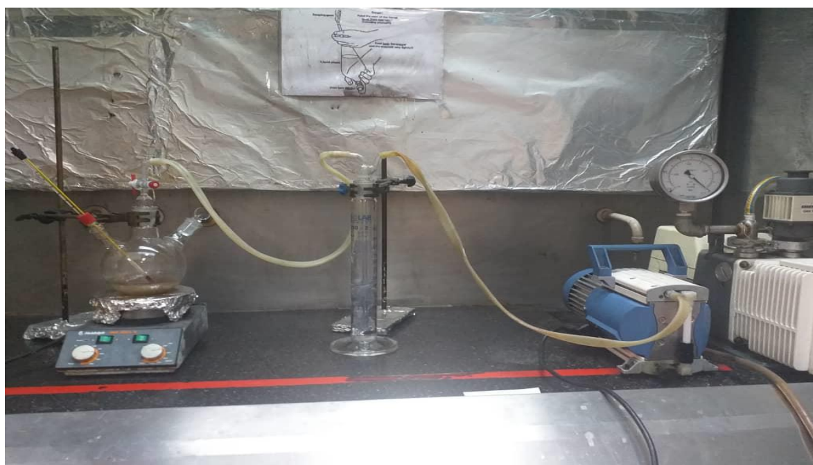
Figure 1. New sulfuric acid recycling system with bleaching soil