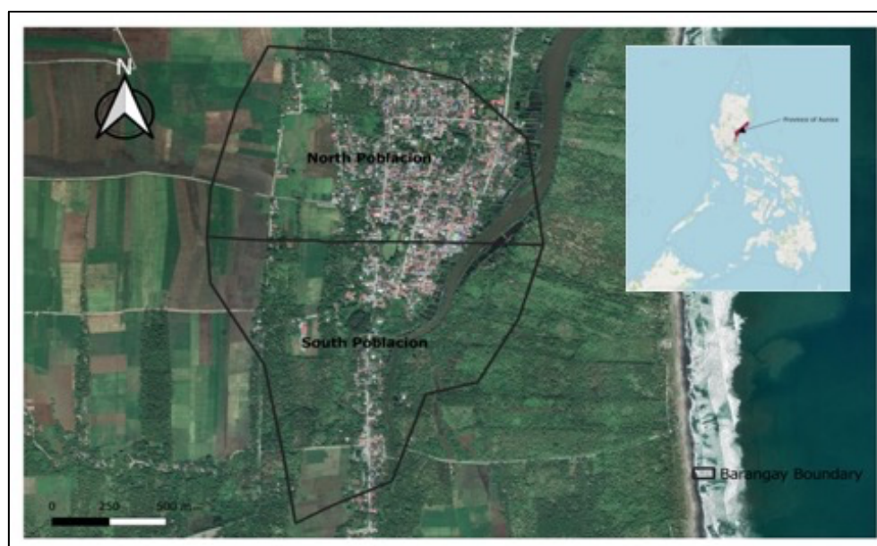
Figure 2. Location map of the study site in Dipaculao, Province of Aurora in the Philippines