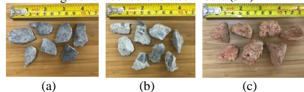
(a) (b) (c)