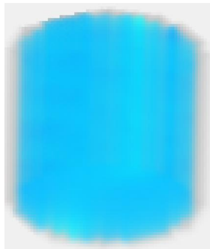
Figure 1. 3D tomogram obtained from the ERT method for gas dispersion inside the small-scale coaxial mixer equipped with the Scaba impeller at the co-rotating mode (central impeller speed = 350 rpm, anchor impeller speed = 10 rpm, and aeration rate = 0.12 vvm).

The gas hold-up profile obtained from the ERT method for the coaxial mixer equipped with 50 L vessel is shown in Figure 1. This coaxial mixer was furnished with a Scaba and an anchor impeller. It was found that the flow regime obtained by the co-rotating coaxial mixer at a central impeller speed of 350 rpm, anchor impeller speed of 10 rpm, and an aeration rate of 0.12 vvm was under the complete gas dispersion condition. In fact, as can be seen in Figure 1, under these operating conditions the gas hold-up was uniformly distributed inside the mixing vessel.