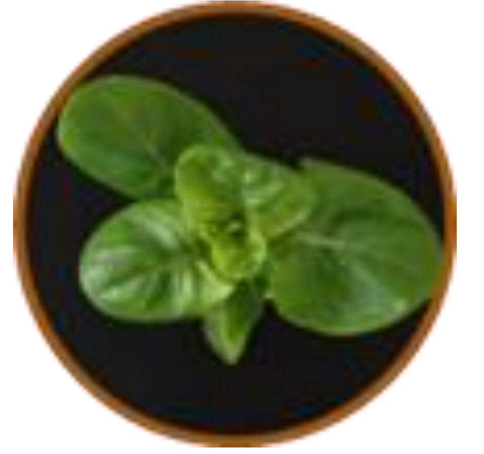
Lettuce Lactuca sativa , 'Little Gem'

Introduction. Selenium (Se) is an essential trace element for human health acting as an antioxidant, helping reduce the risk of chronic and cardiovascular diseases, etc. Enrichment of hydroponic nutrient solution with Se is one of the way for the enhancement of Se in leafy vegetables. The study aimed to determine the responses of lettuce ( Lactuca sativa , 'Little Gem') cultivated under different white light-emitting diodes (LED) lighting to Se content in hydroponic solution.