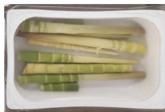
Figure 1: Shoot packaged in ATM1

Materials and packaging condition. Fresh bamboo shoot were collected in Tiziano Falco farm (Corigliano, CS, Italy) and peeled. were pre-treated in a chlorinated water solution and then and subsequently dried and packaged in MAP using heat-sealable polyamide and polyethylene (PA/PE) trays. The tested gas mixtures are 2%O 2 , 5%CO 2 , 93%N 2 (ATM1), and 3% O 2 , 7% CO 2 , 90 % N 2 (ATM2). Samples were stored at 4°C for 28 days.