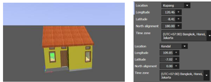
Figure 1. Drawing House and Adjust Location in Dialux.

The method used quantitative-descriptive. In the first stage of this study, literature review is conducted in previous studies that examines the typography of development in subsidized housing. The initial and after development plan was described through AutoCAD to then be simulated on the Dialux (Figure 1).