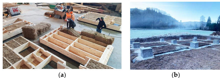
Figure 2. (a) Detail of the assembly of the wooden structural frame. Each element is filled with straw; (b) A picture of the granite blocks and the concrete trusses that constitute the foundations.

The buildings are designed for self-construction by the association members, only the concrete foundations have been built by a construction company. To enable self-construction, a dry construction system is used, incorporating timber, gypsum fiber panels, and primarily bio-based insulation. Hemp fills the wooden structural frame, while fiberboards act as exterior insulation. Dry connections and construction systems enhance adaptability and flexibility. Low-tech building systems play a vital role, reducing construction costs. The entire project costs about 1.37 million euros (excluding taxes), approximately 1400 €/m 2 . Passive thermal solutions and solar energy integration minimize operational costs and emissions. The second frugal building reported is a detached house designed by the French based firm, Studio Lada. The project's design draws inspiration from the barn archetype. Inside the building is organized on two floors. Frugality guides material selection and local labor usage. Sawnwood is the primary material, promoting local businesses and reducing environmental impact. The wooden frame, prefabricated locally, is filled with straw for insulation (Figure 2) and then transported to the construction site for assembly.