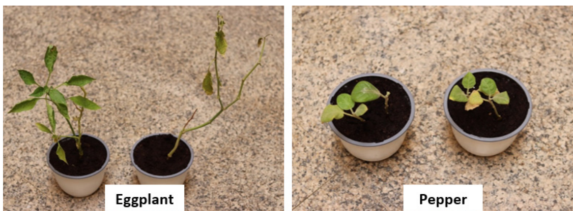
Figure 3. Observational comparison on the plant with the use of chitosan solution ( Left ) and without it ( Right ).