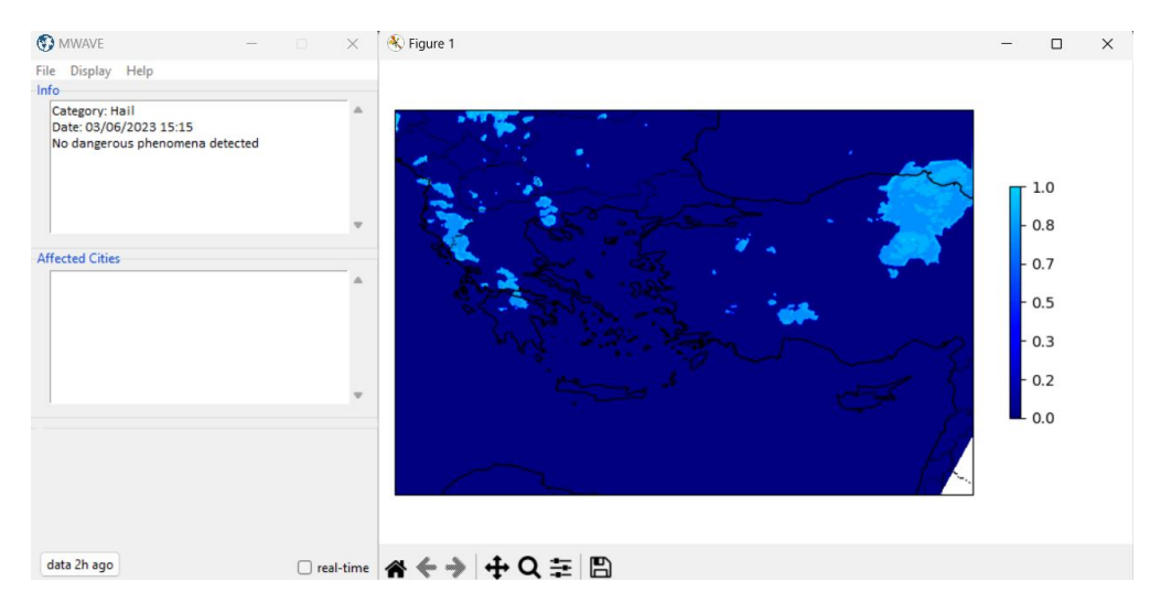
Figure 3. Screenshot of the graphical environment of the application to detect hail for the date 03/06/2023 15:15. .