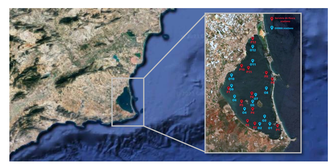
Figure 1. OISMA and Servicio de Pesca stations where measurements have been made.

The time interval of these historical series is about 5 years, form 2017 until 2022. Data comes from different monitoring stations scattered throughout the Mar Menor and have subsequently been standardised by the supplier to a common grid, as shown in Error! Reference source not found. where is represented, in blue, OISMA (Oficina de Impulso Socioeconómico del Medio Ambiente) stations and, in red, the Servicio de Pesca stations.