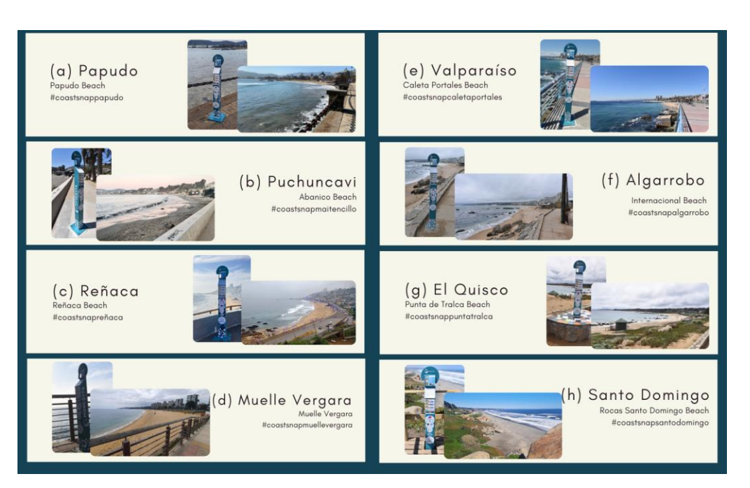
Figure 3. Located CoastSnap bases Valparaíso region. (a) Papudo beach; (b) Abanico beach; (c) Reñaca Beach; (d) Muelle Vergara; (e) Caleta Portales Beach; (f) Algarrobo beach; (g) Punta de Tralca beach and (h) Rocas de Santo Domingo.

The installation of CoastSnap bases has given communities living in coastal municipalities the opportunity to participate in the collection of high-quality data that is used by researchers and coastal managers to monitor beaches, detect critical areas, and analyze the vulnerability of the coast to coastal hazards [6]. The datasets provided by citizens are reliable and useful for coastal management, geomorphological studies, and analysis of changes in extreme events [5, 6]. Until July 2023, the communities have shared more than 350 photographs through social networks and the CoastSnap app. That has allowed us to know in some beaches the inter-daily variability of the beach, the high tide lines, and the impact of a coastal storm. This contributes to reducing the enormous gap of data and information existing in coastal areas, which benefits not only the scientific work for the understanding of hydro-morphodynamical processes but also enhances the development of indicators, and tools for decision-making that favors a sustainable and safe development of these areas.