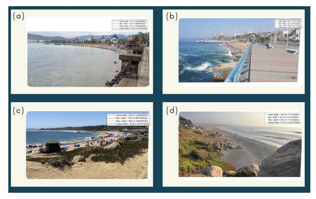
Figure 4. Width of beaches derivate CoastSnap. (a) Papudo Beach; (b) Caleta Portales Beach; (c) Punta de Tralca Beach and (d) Rocas de Santo Domingo beach.

installation in Chile. The images shared by citizens contribute to the construction of data collections that provide necessary information for integrated coastal management and improve the understanding of long-term littoral dynamics, monitoring the changes in land uses, impacts of tidal waves, and recuperation of beaches before extreme events [6].