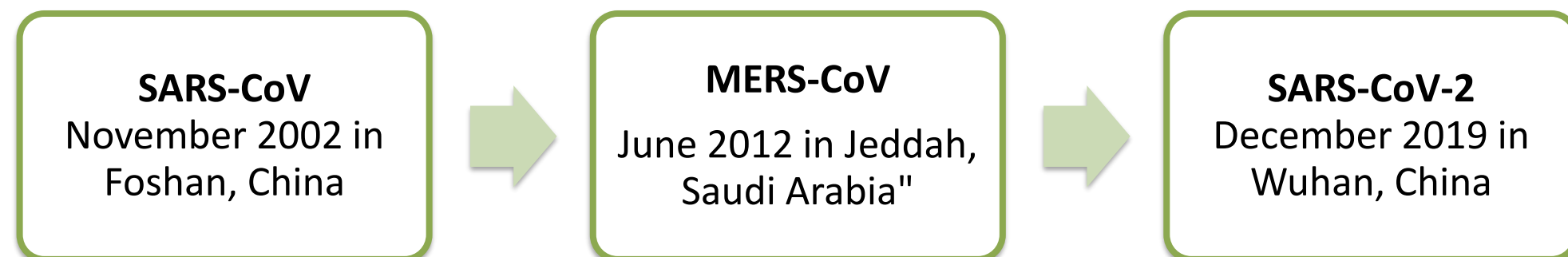
Figure 1. Emergence of new coronaviruses up to the major COVID-19 pandemic.

In recent decades, new deadly coronaviruses (CoVs) have emerged, causing highly infectious diseases in human society, resulting in threats to public health and the global economy (Figure 1).