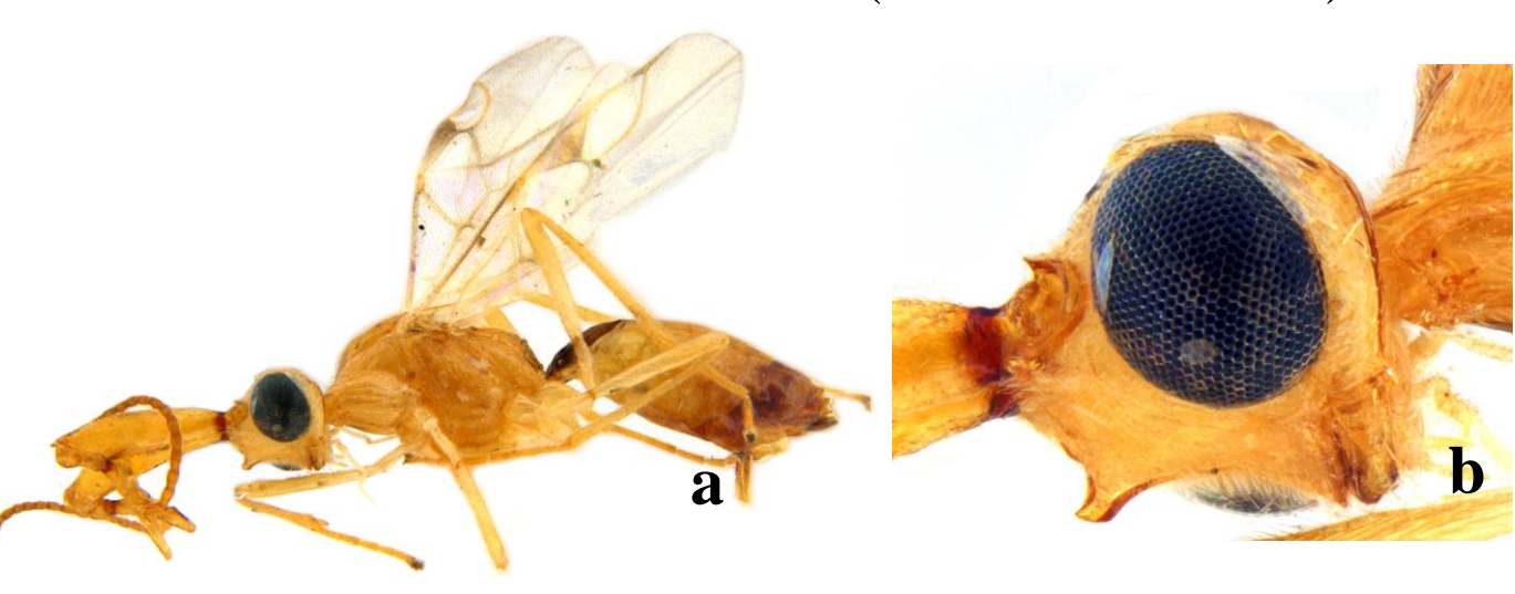
Fig. 2: Streblocera ( Asiastreblocera ) sp. female (a. Habitus, b. Lateral face view showing acute horn)