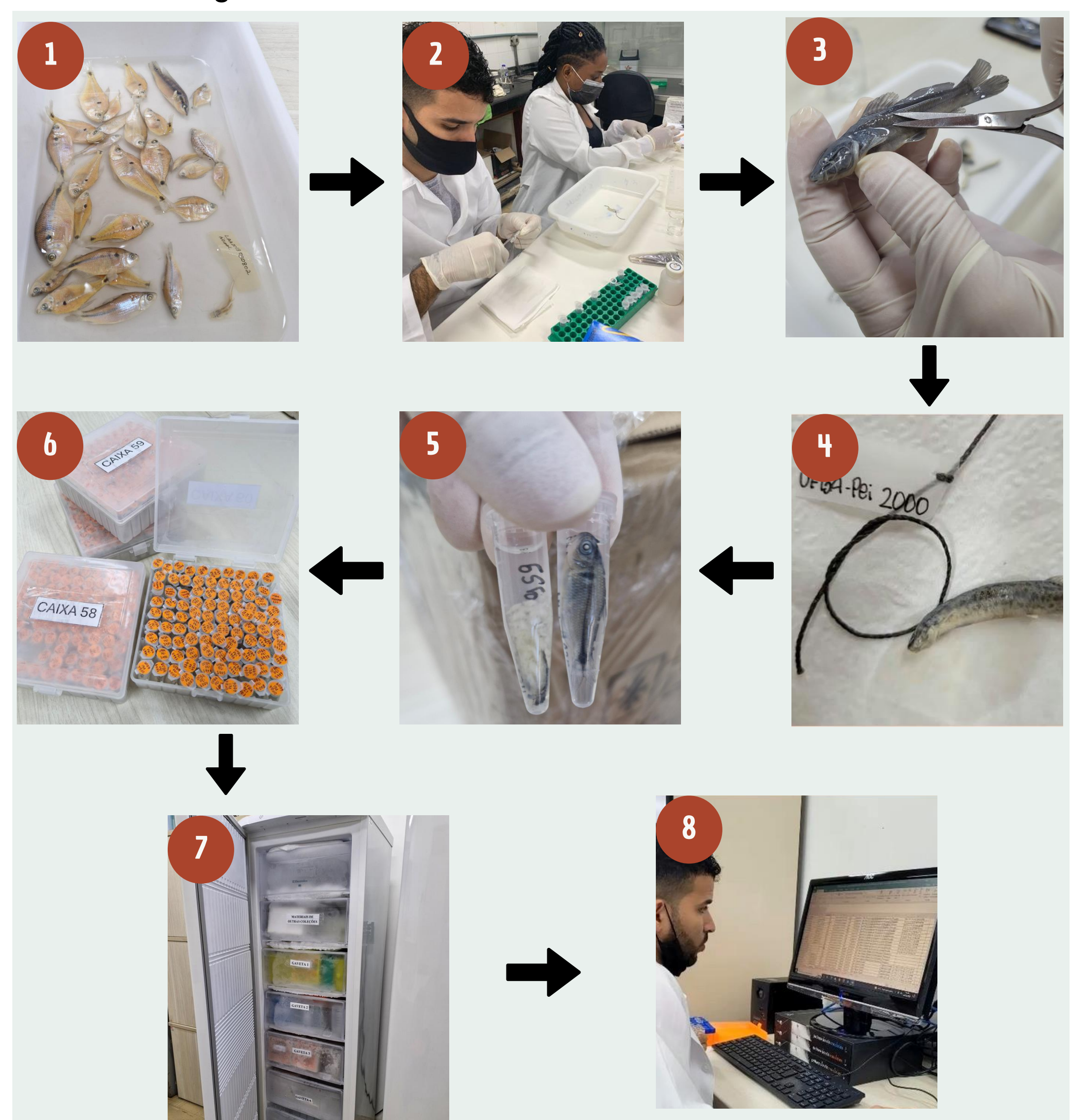
Figure 1: Material and process for collecting and storing tissues: 1 - Material scrting; 2 - Taxonomic identification; 3 - Aliquot of the specimens; 4 - Labellingthe material; 5 - Tissue samples stored in eppendorf tubes; 6 - Eppendorf with tissues organized in cryoboxes; 7 - Cryoboxes kept in freezers (at -18°C); 8 - Computerization and material tipping.

The curation and management of the collection are carried out in four stages: first, the sorting and identification of the material at the lowest possible taxonomic level takes place; second, we proceed to the sample storage, during which a tissue sample is taken and the specimens are labeled; third, an aliquot or, when possible, the entire specimen is stored in Eppendorf tubes organized in cryoboxes, which are kept in freezers at -18°C; and finally, the material is digitized and cataloged in the collection's database. The entire process can be observed in figure 1.