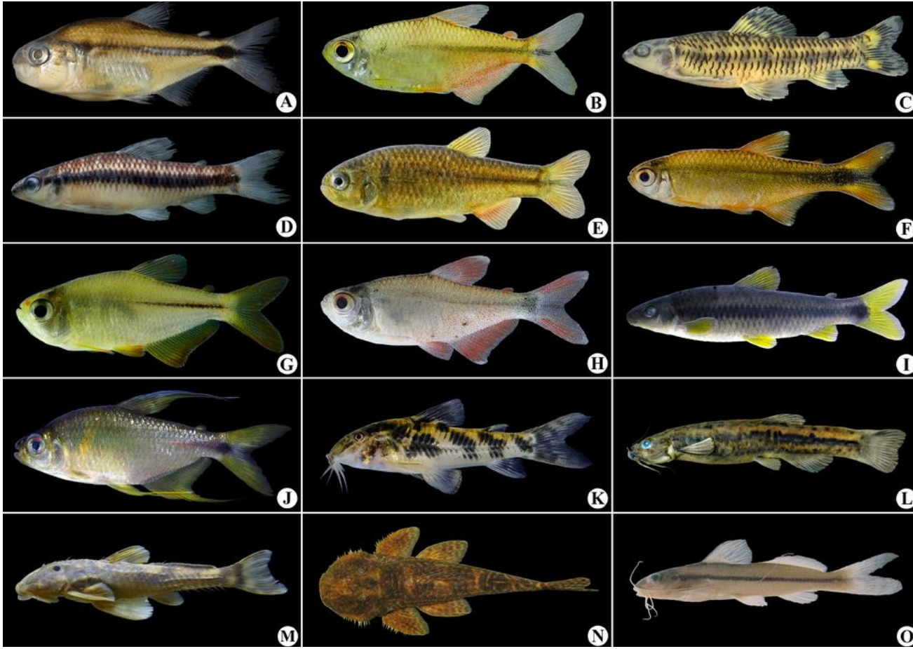
Figure 3: Representative fish species of the fish collection of the Museu de Zoologia da Universidade Federal da Bahia. A. Astyanax brucutu; B. Astyanax vermillion; C. Characidium kamakan; D. C. samurai; E. Hasemania piatan; F. Hyphessobrycon brumado; G. H. itaparicensis; H. H. parvellus; I. <u>Leporinus melanopleurodes</u>; J. <u>Nematocharax venustus</u>; K. <u>Aspidoras kiriri</u>; L. <u>Copionodon elysium</u>; M. <u>Hirtella carinata</u>; N. <u>Pareiorhaphis lophia</u>; O. <u>Pimelodella itapicuruensis.</u>

Siluriformes, Cichliformes, and Gymnotiformes, respectively.