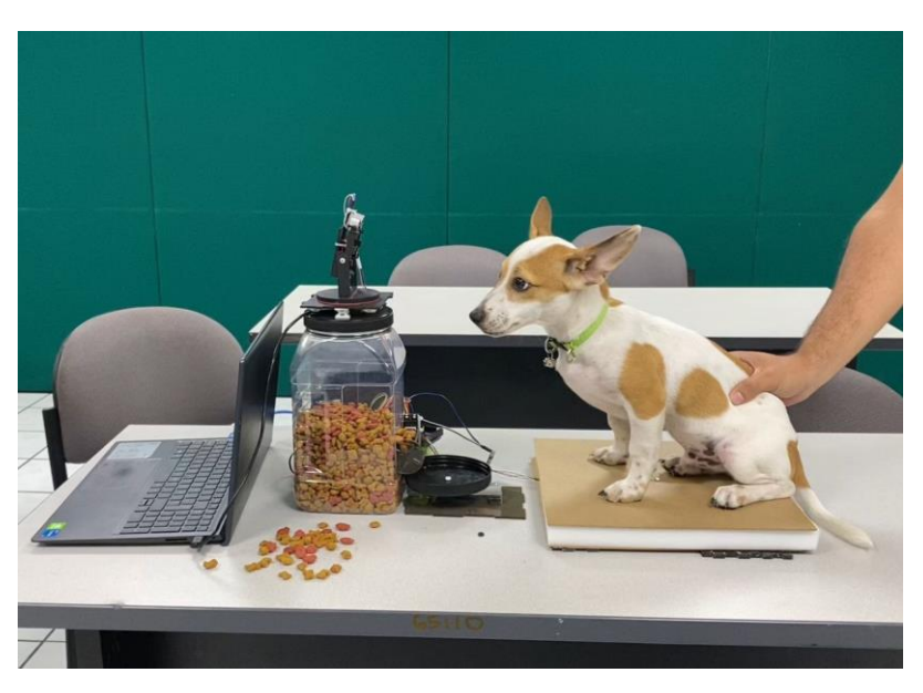
Figure 2. Smart pet feeder prototype.

Testing demonstrated that the system effectively identified pets, dispensed appropriate food portions based on weight, and provided real-time monitoring. The YoloV5 model consistently identified dogs with high precision, as seen on Figure 3.