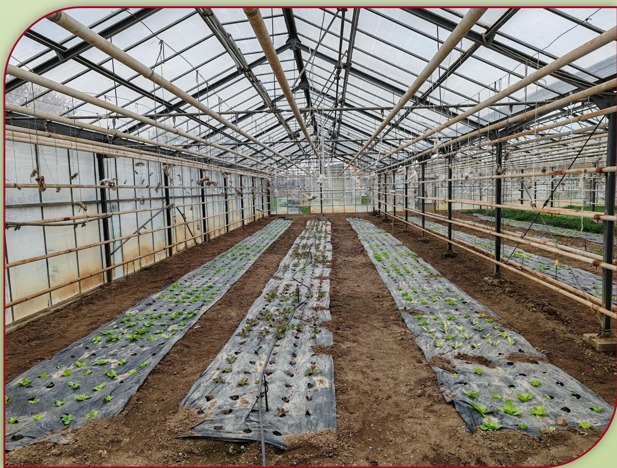
Figure 1. The experiment in the greenhouse

A two-factor ANOVA analysis model was used to determine the influence of the tillage treatments and two organic fertilizers on the lettuce morphological parameters and yield. Duncan's test was performed to stipulate the significance of mean differences ( p < 0.05 ) between the tillage treatments and applied organic fertilizers using SPSS software version 22.0 (IBM Corporation, New York, NY, USA).