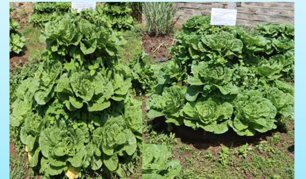
Figure 1. Chinese cabbage growing on wonder multistory garden with 6 terraces.