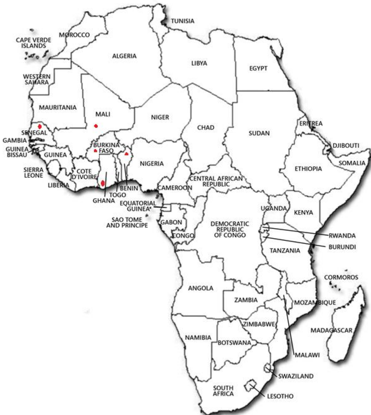
Figure 1. Map of Africa showing the study countries (highlighted in red)

The population of Burkina Faso averaged 8.86 Million from 1960 until 2012, reaching an all-time high of 16.46 Million in December of 2012. Ghana has a population of 24.3 million [22], and gold is a major export commodity, with this metal bringing in nearly 48 percent of the country's revenue. After South Africa, Ghana is the largest gold producer in Africa and in the first quarter of 2012, the country earned around $1.5 billion through export of gold. According to the Bank of Ghana, the