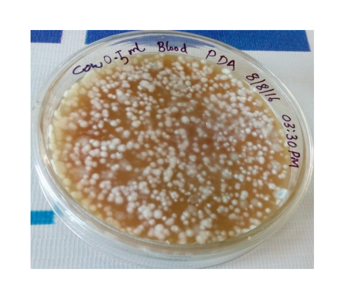
Fig 1 Fig 2

Fig1: Plate 1 of Mastitis infected bovine blood sample (0.5ml of 10<sup>-3</sup> serially diluted sample) on PDA after 4 days of incubation at 25<sup>0</sup>C Fig 2: Plate 2 of Mastitis infected bovine blood sample (0.5ml of blood sample) on PDA after 4 days of incubation at 25<sup>0</sup>C