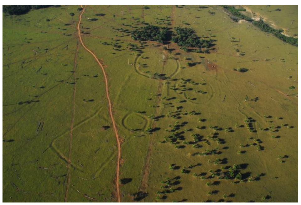
Artificial mound in the Marajó island