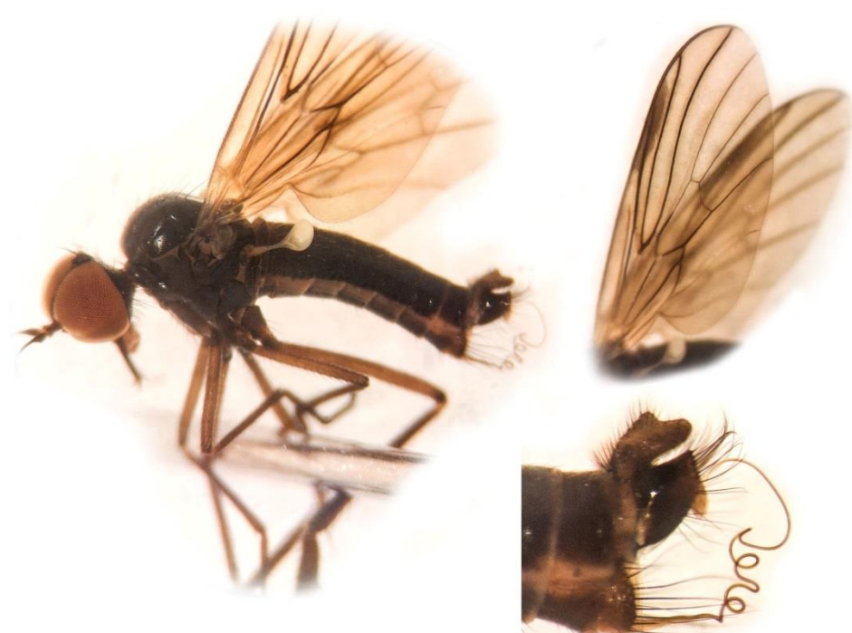
Fig. 1. Rhamphomyia anfractuosa , ♂. Left: habitus, lateral view; top right: wings; bottom right, terminalia, left-hand side.

Material examined. 1 ex., Vidin distr., Vinarovo Village, N 44.0988°, E 22.8127°, 05 Jun 2023, T. Tsvetanov leg. (Fig. 5).