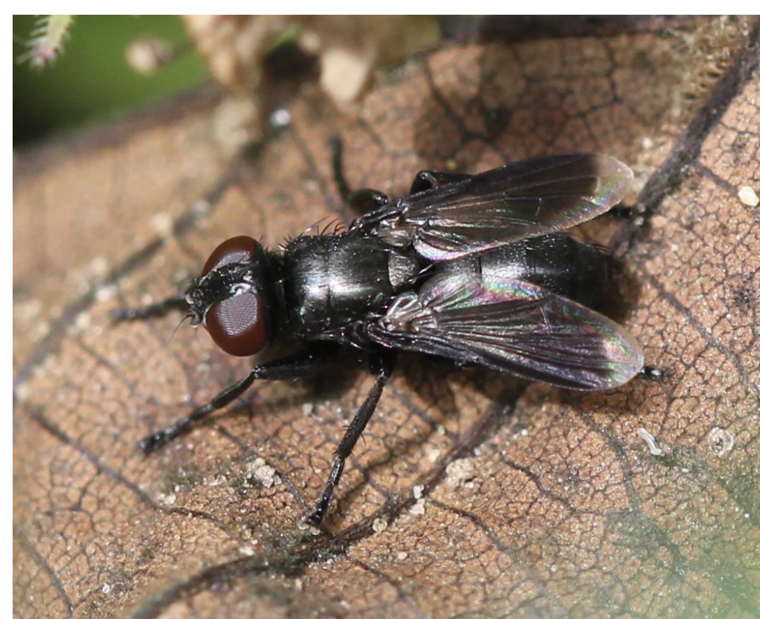
Fig. 3. Melanophora roralis , ♀.

Material examined. 1 ♂, Vitosha Mts, Momina skala Hut, N 42.6231°, E 23.2509°, 16 Jul 2022; 1 ♂, Vitosha Mts, Kumata Hut, N 42.5899°, E 23.2520°, 6 Aug 2023; 1 ♂, Chepan Mts, Petrovski krast Peak, N 42.9472°, E 22.956°, 01 May 2025, S. Indzhov leg. (Fig. 5).