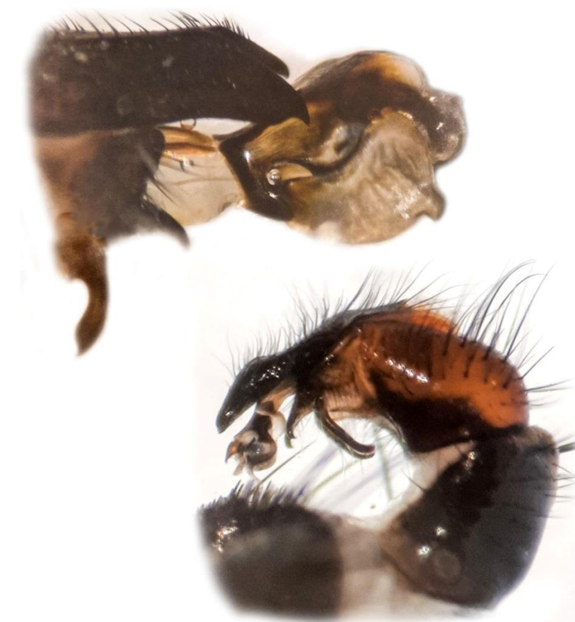
Fig. 4. Sarcophaga schusteri , ♂ genitalia, top left. Sarcophaga belanovskiyi , ♂ genitalia, bottom right.