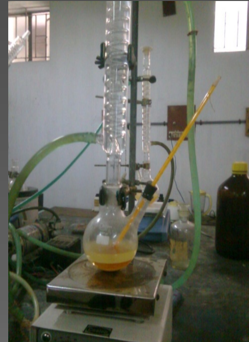
Fig. 1 Experimental setup for the biodiesel production using three-step acid catalyzed method .