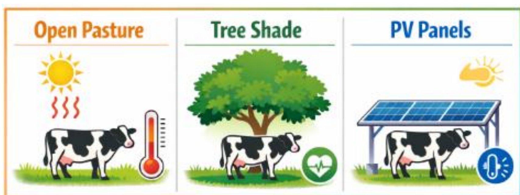
Figure 1. Scheme comparing: open pasture x tree shade x PV panel.