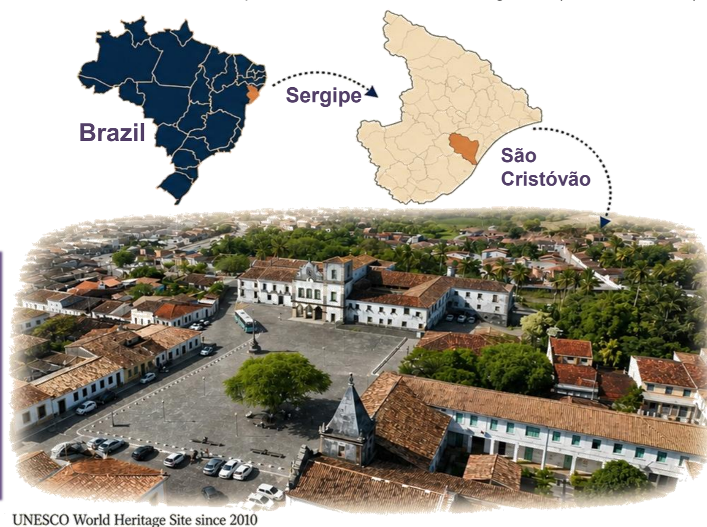
Figure 01. Location of São Cristóvão in Sergipe, Brazil, and aerial view of São Francisco Square, a UNESCO World Heritage Site (UNESCO, 2010).

This research examines how the historic city of São Cristóvão (SE, Brazil) has incorporated the UN 2030 Agenda into local policy from 2019–2025. Although the city has gained external recognition through Sustainable Cities awards, a systematic analysis of its SDG-related governance is lacking. The study aims to: (i) map municipal programs across social, environmental and economic dimensions; (ii) classify them by the 17 SDGs; and (iii) assess coherence between policy goals and development indicators.