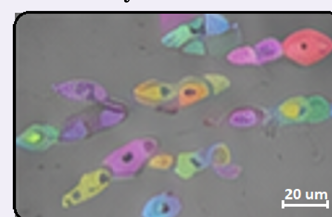
MDA-MB-231 (high metastatic potential)