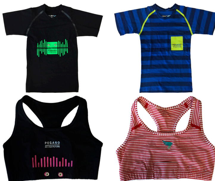
Figure 1. Sample of PEGASO Smart Garments: on the left, the Visible Sensor line, on the right, the Hidden Sensor line.

The Second Phase was addressed to the exploration of sensors and wearable technologies for health management. Each participant tested one Life tracker for one week.