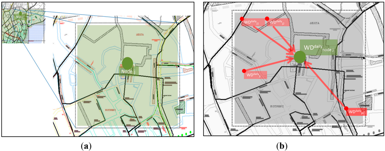
Figure 2. (a) Each node will be a node of the hydraulic model that will be used to estimate the pressure map out of the water demand map; (b) Each node corresponds to a water demand value that comes out by adding the household water demands that are supplied by the specific node of the network.