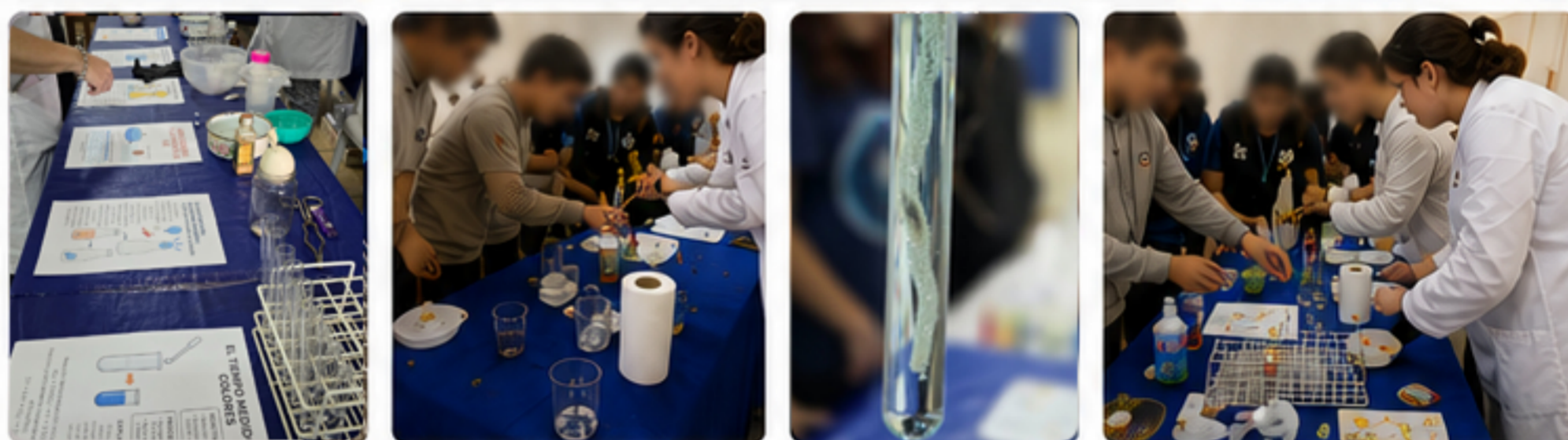
Students participated actively by predicting outcomes, observing phenomena, asking questions and collaboratively constructing explanations.