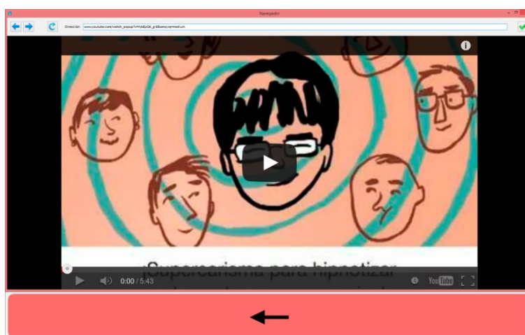
Figure 3. Example of the application browser to locate the videos of interest