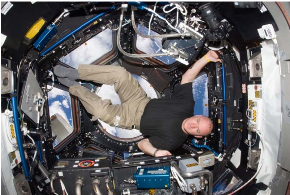
FIGURE 1. NASA astronaut Scott Kelly, Expedition 25 flight engineer, is pictured in the Cupola of the International Space Station on Oct. 14, 2010.

reference in this search, since, just as in a hospital, it is essential to pursue the comfort of the user as an influential situation both in the cure of the patient (especially the long stay ) as in the elimination of possible nosocomial diseases through prevention -through asepsis-, along with other environmental qualities such as shapes, colors, smells, sounds, materials, lighting, temperature, radiation control, encounters, travels , relationship between specific spaces, accesses, signs, openings and levels, through research in architectural matters it is possible to equip the members of a crew destined to establish their home in another celestial body, of the necessary well-being for a better physical development and psychic of each one of the members that conform it. If, based on practice and studies, "a comfortable stay for the patient means a better and faster cure..." (Le Corbusier, in relation to his project for the Hospital of Venice, 1961), with a similar approach also we will be able to take a leap forward in terms of spatial architecture since, after all, the first prototypes of habitats with which we will have to accommodate a possible planetary settlement distant from the terrestrial one, will not only be a "home for the man", but they will represent those spaces in which perhaps the same astronauts should be treated as if they were their own health centers or hospitals.