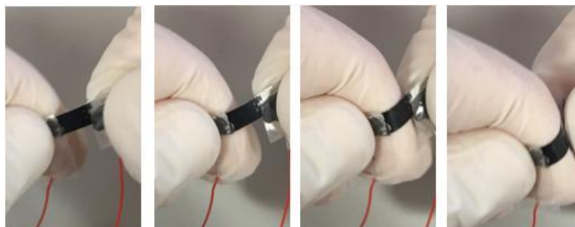
Figure 2: Snap-shots of the nanocomposite during hand-stretching and simultaneous electrical monitoring through the bonded wires.

film, are recorded. These variations are directly related to the distribution of the MWNTs into the polymer matrix which is not completely uniform. It is worth noting that the calculated resistivity is quite low if compared with the resistivity of a film made with a 7% MWNTs weight fraction. In the latter case, in fact, the average resistivity is 0.10 \Omega \text{ m} [7] against an average 0.004 \Omega \text{ m} of the here presented MWNT-PI nanocomposite. This behavior depends on the amount of carbon nanotubes dispersed in the polymer matrix: conductivity or resistivity of a given nanocomposite made of carbon nanotubes embedded in an insulating polymer matrix, is dictated by the number of points of contact between the nanotubes and the distance between the neighboring ones.