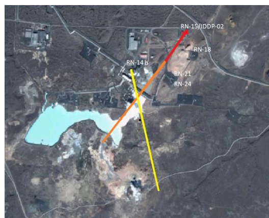
Figure 1. An overview of Reykjanes geothermal field and the locations of wells and well tracks.

An overview of Reykjanes geothermal field and locations of wells IDDP-2, RN-14b, RN-18, RN-21 and RN-24 are shown in Figure 1. Wells IDDP-2 and RN-14b are directionally drilled (approximate tracks are shown in Figure 1) and wells RN-18, RN-21 and RN-24 are all drilled vertically. The depth of the wells in addition to the size and depth of the production casings are shown in Table 1. Once well RN-15/IDDP-2 was deepened during the Iceland Deep Drilling Project (IDDP), it was disconnected from the surface pipelines. Therefore, during the following experiments, well IDDP-2 is not connected to the other wells via surface pipelines.