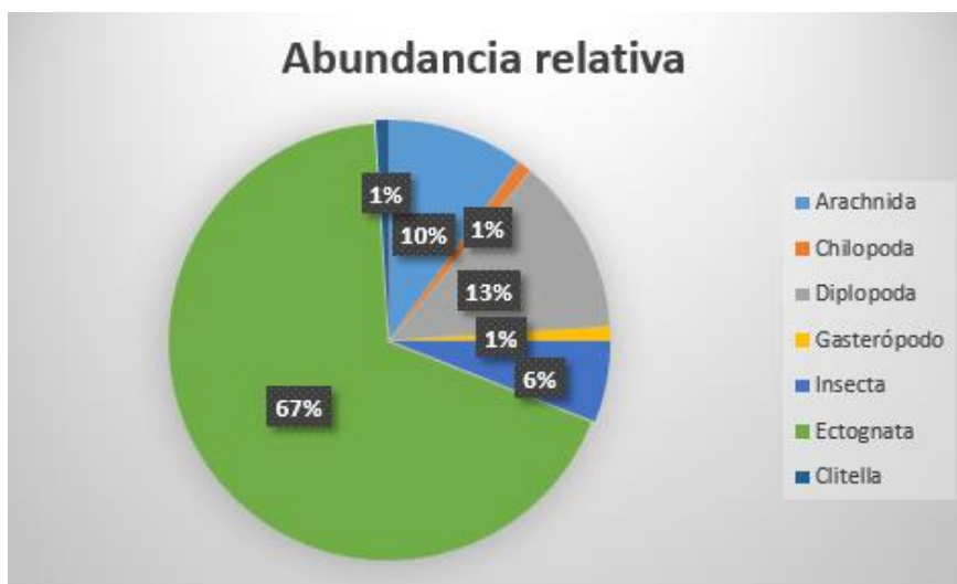
Illustration 1 Relative abundance of invertebrate classes in the Transect of the intervened Area