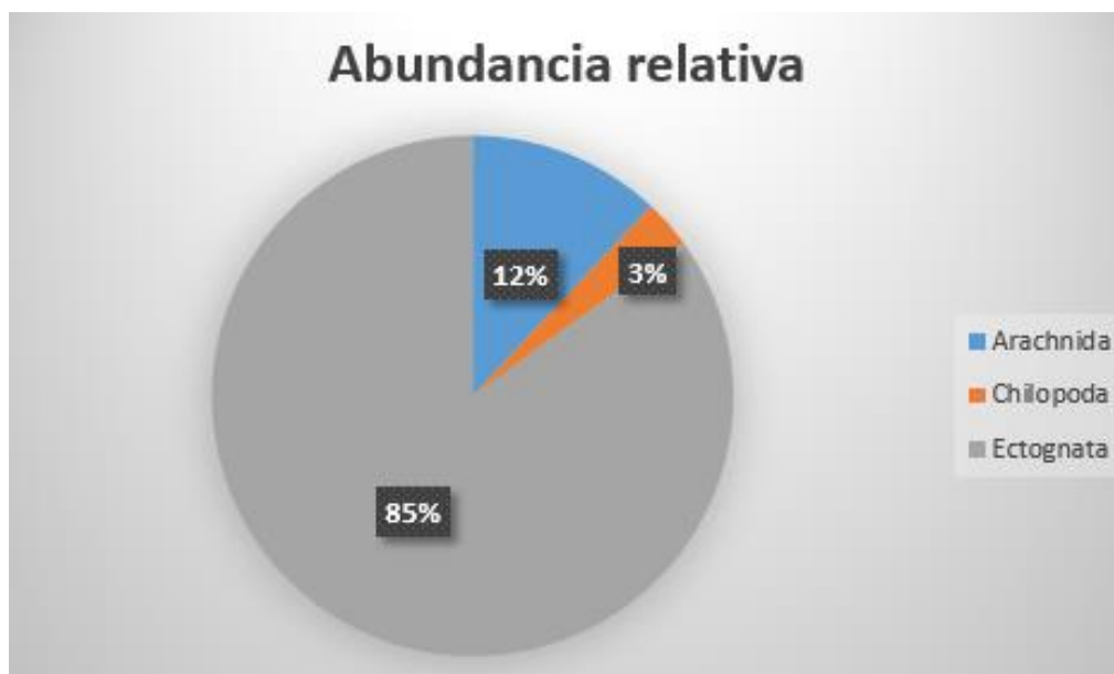
Illustration 3 Relative abundance of invertebrate classes in the Secondary Forest Transect