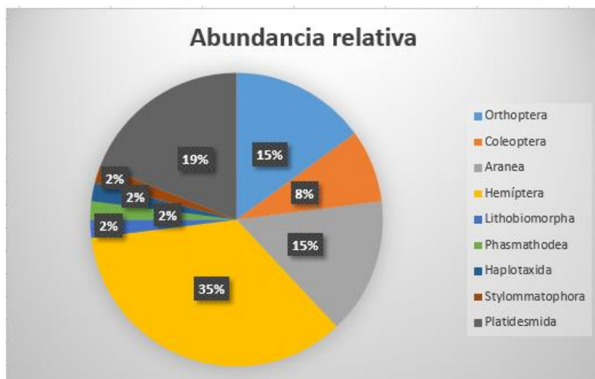
Illustration 2 Relative abundance of invertebrate orders in the Transect of the intervened Area