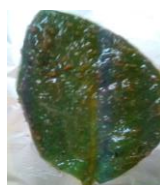
Leaf coated in gel based of carrageenan and Z. jujuba Mill peel powder