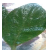
Leaf coated in carrageenan gel