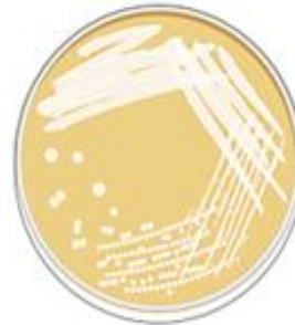
Bacillus altitudinis KA15