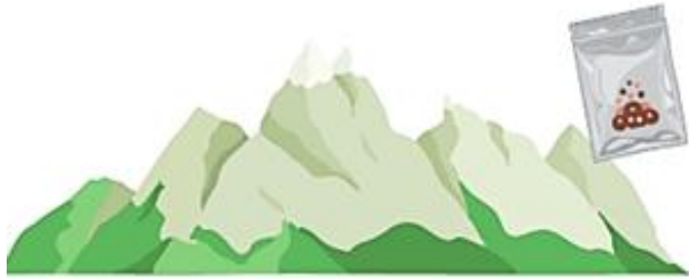
Soil sample from Djurdjura mountains