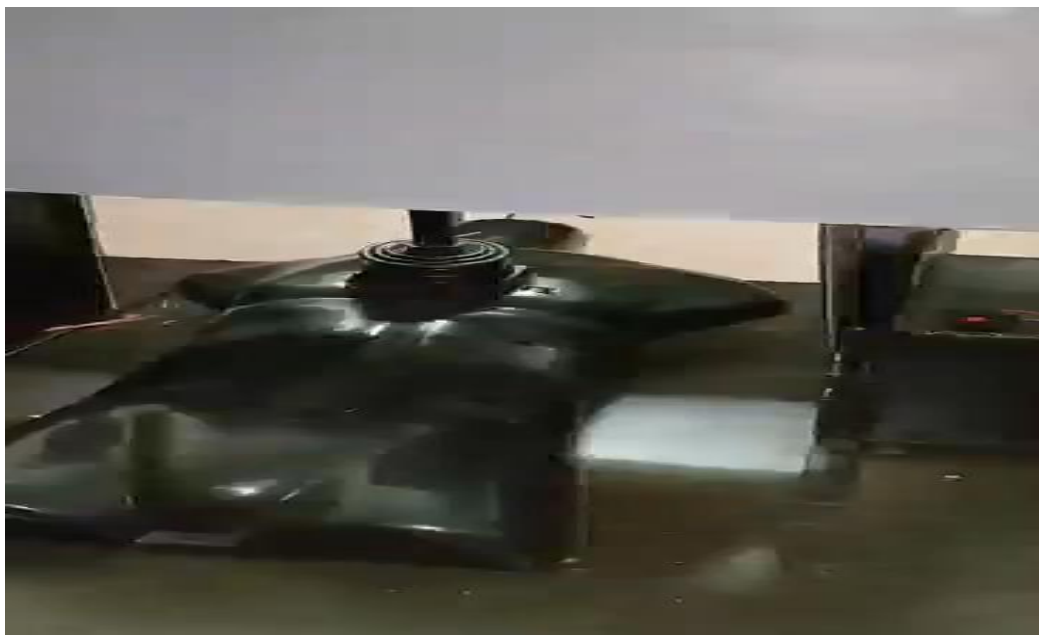
Figure 5. Final prototype of the proposed device testing on dummy.