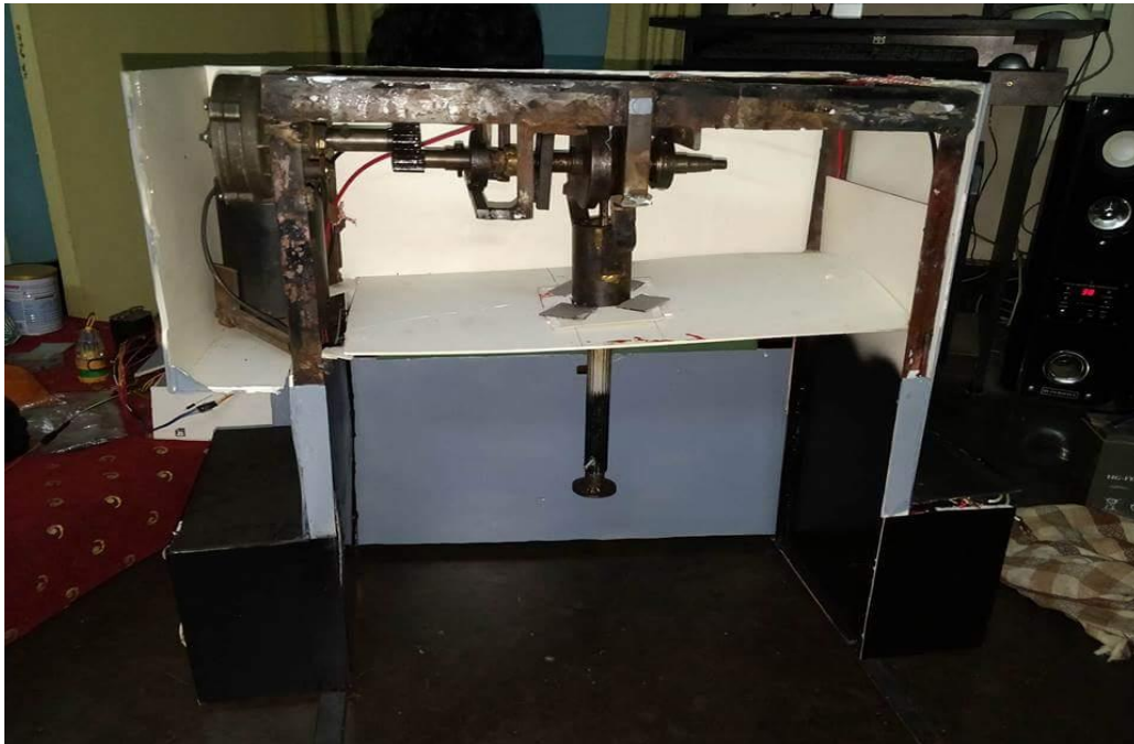
Figure 4. Prototype of the proposed device.

Figure 4 demonstrates the prototype of the proposed device. This device is developed in the Engineering Laboratory at the Department of Electrical and Computer Engineering of North South University. The proposed automated device is piston driven based. It provides sternal compressions at the needed rate of 100–120 compressions per minute and complete a compression depth of at least of 2 inches. The device is made up of using locally available raw materials procuring from the local market. After that all parts were assembled and tested in the laboratory. The device is designed through the combination of mechanical and electrical components. After development and integration of the device. The performance of the system was tested on the human like dummy. Figure 5 provides finishing model of the proposed device showing testing on dummy.