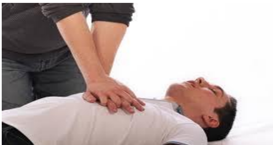
Figure 1. Manual CPR process given by a person [7].

This device is automated piston driven based. It provides sternal compressions at the needed rate of 100–120 compressions per minute and complete a compression depth of at least of 2 inches. The proposed device operation is easy as there is no external human being need to do the manual perform of the CPR. The proposed device is automated and it has got controlling on and off operation buttons; see block diagram in Figure 3. First the device needs to be placed on stretcher or on the place where the automated CPR will be performed. Then the proposed device needs to be placed over the chest of the cardiac patients.