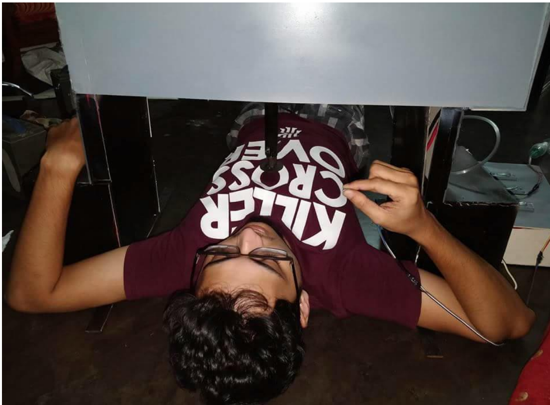
Figure 6. Final prototype of the proposed device testing.

After testing it on the human like dummy it was tested on real human test subject Figure 5 provides finishing prototype of the recommended machine testing on dummy. In Figure 5 the top part of the device looks gray because the internal part of the system was covered with light gray color board. Figure 6 shows final prototype of the proposed device testing on real human test subject. The device has been tested on 10 different real human volunteers to test the reliability of the performance of the device. An example of testing on one real human test subject is demonstrated here in Figure 6. After testing on human test subject it is observed that the device is working according to our design requirements and it meets those. Additional smart features have been added with this device. Due to lack of page limit more technical details and discussion in more details were not possible to provide here in this paper. However, the authors of the paper are writing an Article with more details of the devices and it will be submitted to MDPI for review.