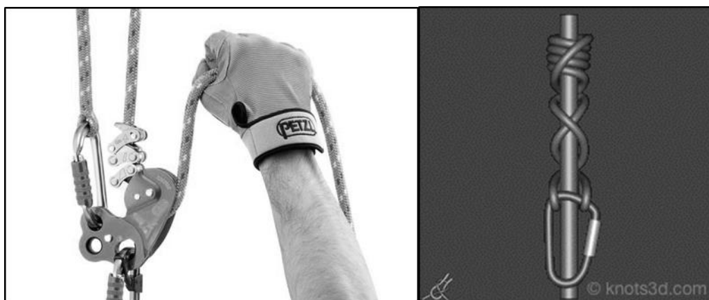
Figure 2. Zigzag descender (on the left) and Valdotaïn tresse (on the right).

The survey has indagated the use of a relative innovative equipment, such as the electric battery powered chainsaws for pruning. The half of the respondents (42 out of 84 respondents) and 5 out of 6 arborists who have just started their career (less than one year of experience) declare to use electric chainsaw either often or always. Electric tools are widespread in all Italian areas, with a prevalence in the Northern West part of the country. Furthermore, it was studied what was the perceived risk in the use of these equipment, asking if the operator considered electric tools having higher, lower or the same degree of danger in comparison with the traditional chainsaws. The most part of the respondents thinks that the two types of chainsaw are equally dangerous, while the 19% consider electric tool less dangerous; 8% of the sample did not have a clear opinion.