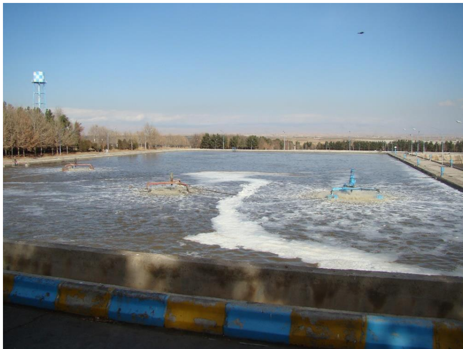
Figure 1. Perkandabad wastewater treatment plant.

population covered by it is equal to 100000 residents. The treatment process used in this treatment plant is an aerated lagoon with complete mixing, and the raw wastewater is treated by passing through the waste collection unit, aeration lagoons, sedimentation ponds, execution pond, and disinfection unit. Due to the discharge of effluent from the Perkandabad No.1 treatment plant into the river at certain times of the year, the design of this treatment plant is based on surface water discharge.