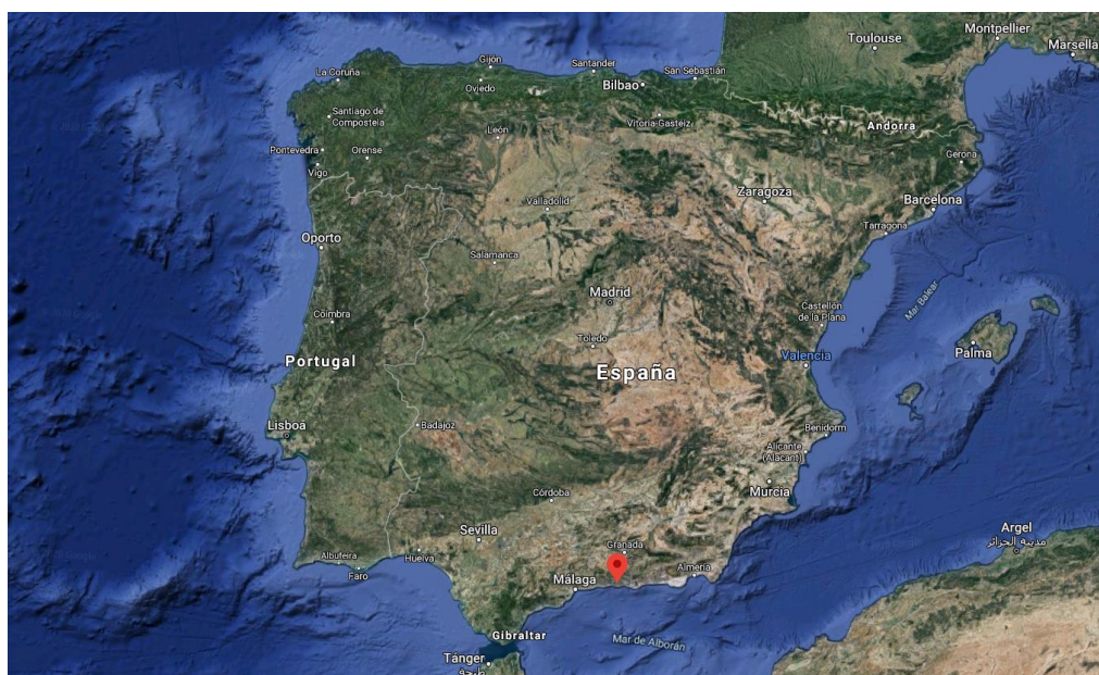
Figure 1. Location of the weather station of Almuñecar (Southern Spain).

The period of the dataset is a total of 18 years, from 2000 to 2018, being split to training (from 2000 to 2013) and testing data (from 2014 to 2018). Besides, 20% of the training data is used as validation to find the fittest hyperparameters of the models. In Table 1, it can be seen the statistics maximum, mean and minimum values of the variables used in this work.