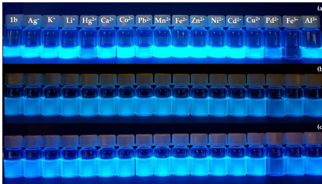
Figure 3. Preliminary chemosensing study of benzoxazolyl-alanine derivative 1b : (a) in the presence of 10 equivalents of each cation, in acetonitrile ( 3 \times 10^{-5} M); (b) in the presence of 10 equivalents of each cation, in SDS (20 mM, pH 7.5)-acetonitrile 90:10 (v/v) solution ( 1 \times 10^{-5} M); (c) in the presence of 20 equivalents of each cation, in SDS (20 mM, pH 7.5)-acetonitrile 90:10 (v/v) solution ( 1 \times 10^{-5} M).

aqueous mixtures of SDS (20 mM, pH 7.5) solution with acetonitrile, 90:10 v/v. SDS aqueous solutions of probes 1a-b displayed a selective fluorescence quenching in the presence of 10 equivalents of Pd 2+ (Figures 2b and 3b). Furthermore, further addition to 20 equivalents of each ion confirmed the selectivity of both crown ether benzoxazolyl-alanine derivatives 1a-b for Pd 2+ (Figures 2c and 3c).