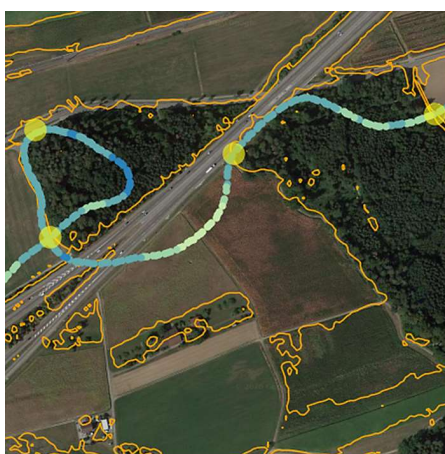
Figure 2. Characteristic features. Blue graded color shows the trajectory of pigeons. Orange lines show the calculated isolines. Yellow circles show intersections of isolines and GPS tracks.

Step 2. Calculating the surface fill density distribution and separation of territories by type of surfaces. Calculation of the distribution of surface fill densities was performed on a layer of objects selected by isolines in Step 1. Each selected object was presented as a centroid. According to the density of available centroids (the number of centroids per unit area), the territories over which the pigeons flew were divided into areas with different types of surfaces. The following factors were taken into account: the fill density of textures with similar repeating patterns, the characteristic sizes of simple objects included in these patterns and the typical distances between these simple objects.