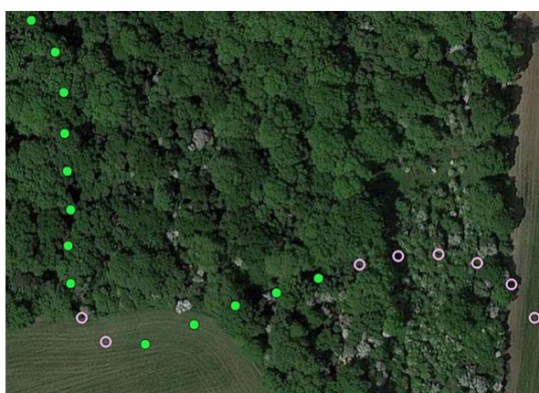
Figure 3. Comparison of the predicted type of terrain and the actual type. Green dots show places that were identified as “forest” based on the properties of the pigeon’s flight. Transparent dots show places that were identified as another type of terrain.

Further, each indicator from the list \{d\_stab, d\_var, h\_stab, h\_var\} was assigned a value of 0 if it is less than 0.21, or a value of 1 if it is more than 0.21. Depending on the total composition of the territory, i.e., on the ratio of different types of homogeneous and heterogeneous textures present in it, the algorithm for assigning 0 and 1 must be re-calculated. For future calculation we set for input arrays [d\_stab, d\_var, h\_stab, h\_var] following output values: [0,0,1,0] = Urban; [0,0,1,1] = Field; [1,1,1,1] = Boundary; [1,0,1,1] = Forest. It was found that the accuracy of prediction of the type of terrain, over which the pigeons flew, according to the combined parameters of the flight of pigeons, is 38%. An example of forest identification is shown in Figure 3. Green circles mark places that are identified as a forest based on the properties of the pigeon's flight.