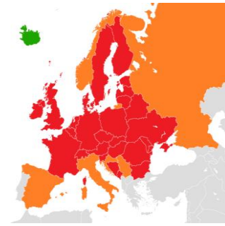
Figure 3 . Airspace completely (red) or partially (orange) closed to air traffic

Delays and cancellations hit airports from Toronto to Tokyo, and the problems had cost the global air-travel industry an estimated $200 million a day.