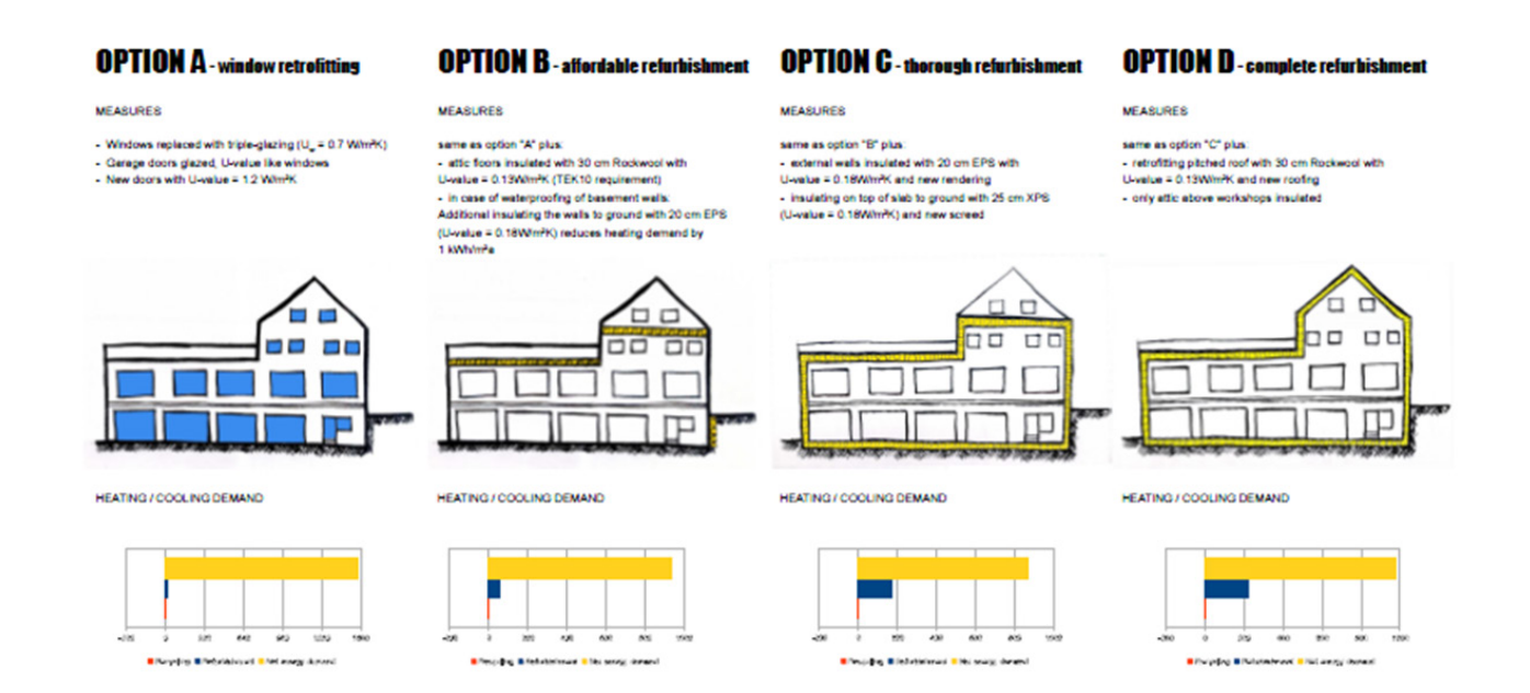
Figure 3. Surnadalsøra renovation levels and CO2 emission accounting (student work)

The students submitted four A1 posters containing project and site plans along with schematic diagrams showing the environmental and architectural strategies used in their design. Student calculation reports show that most of the designs for the renovated building barely reach passive house standard. However, the students do report an increased awareness and knowledge about the vast challenges building professionals need to overcome to unite technical details and high user quality into good environmental performance.