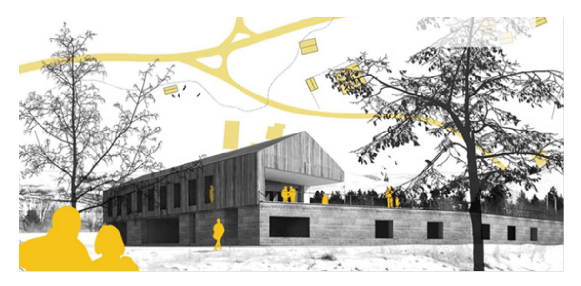
Figure 2. Linesøya project proposal after renovation

The students submitted four A1 posters containing project and site plans along with schematic diagrams showing the environmental and architectural strategies used in their design. Student calculation reports show that most of the designs for the renovated building barely reach passive house standard. However, the students do report an increased awareness and knowledge about the vast