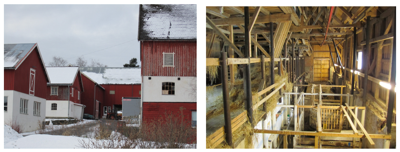
Figure. 4. (a) Rotvoll farm; (b) Rotvoll barn

The students were again encouraged to work on integrated design solutions in which architecture and technology support and enhance each other. They needed to combine good indoor comfort with energy conservation, including energy supply and use of renewable energy. To this purpose, the students are taught a range of tools that can be used to document energy performance, such as ECOTECT and Simien.