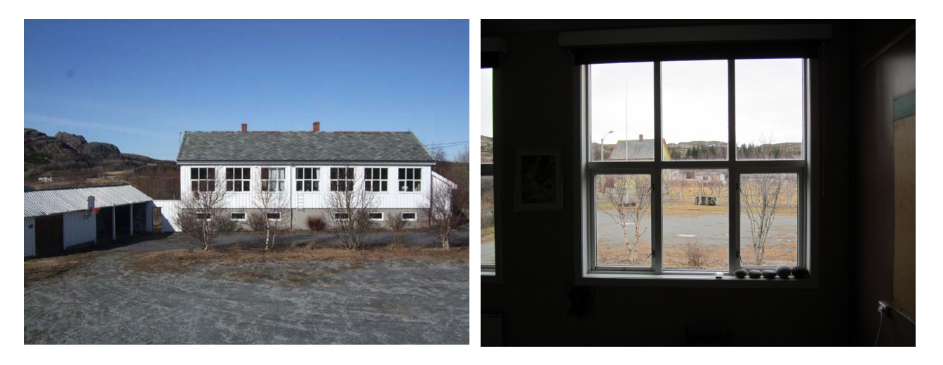
Figure 1. (a) Linesøya school building; (b) view through the window

Is it possible to lower resource use and at the same time increase the quality of the built environment? Is there necessarily a conflict between low-energy design and usability? Can architecture and planning actually contribute to lowering a local community's carbon footprint? And can this be achieved while maintaining a high quality of life and a stimulating built environment?